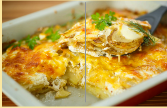
Scallop Cheese Potatoes

Potato O'Brien Cheesy Potatoes Chorizo Potatoes